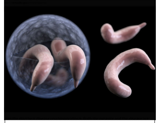
Free-swimming Cryptosporidia sporozites being released from cyst